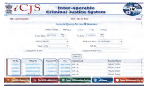
Figure 1: iCJS software at http://admis.hp.nic.in/cjs

The basic objective of the Inter-operable Criminal Justice System has been faster delivery of justice to the litigants in view of the large number of criminal cases pending in various Courts. The reasons for such delays are numerous, the most common being, besides the lack of resources and manpower constraints, the delayed and in-complete transfer of information from Police to Courts, Forensics to Police, Police to Prison, Court to Prison, Prosecution to Court and vice-versa in all cases. The Police, Forensic Science Laboratories, Prosecution, Courts and Prisons are the major stakeholders in the process of delivery of criminal justice in our country.